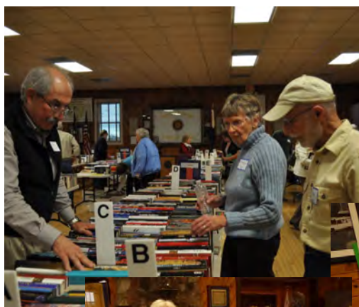
FACL board members and volunteers work hard to prepare for the book sale, but the results make it all worthwhile.

The library is facing drastic reductions to its budget, which has already been cut deeply over the past four years. As you have probably read in the local paper, the county is struggling with an especially difficult budget for the coming year. I don't know just how deep the library cuts will be, but I am sure that the library will need our support as never before. As you contemplate how you will spend your time and charitable donations, please keep the Amador County Library in mind.